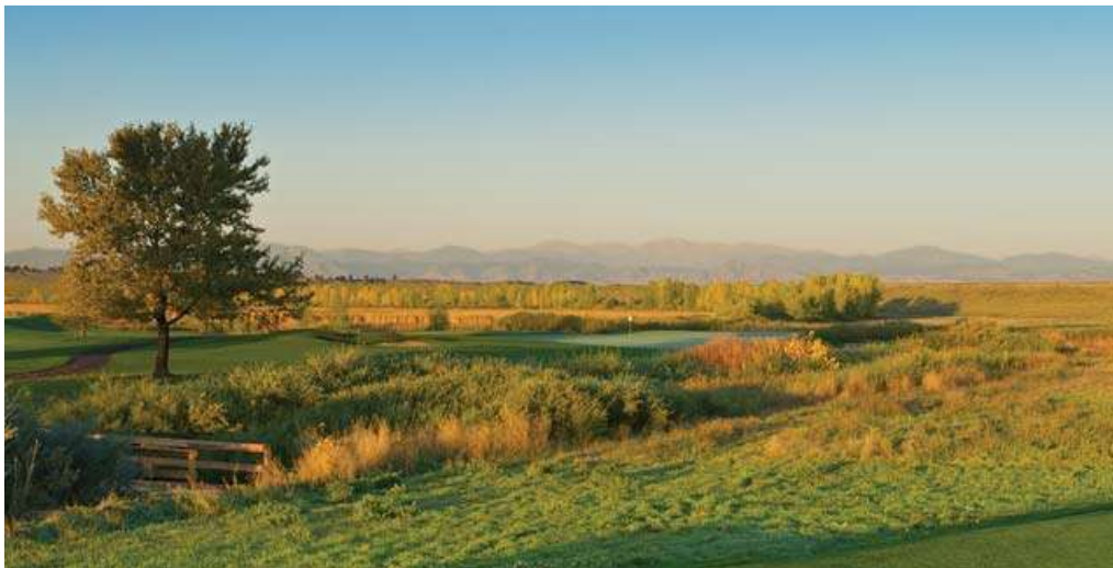
Spring-like weather makes it tempting to hit the CommonGround Golf Course nearby in Aurora